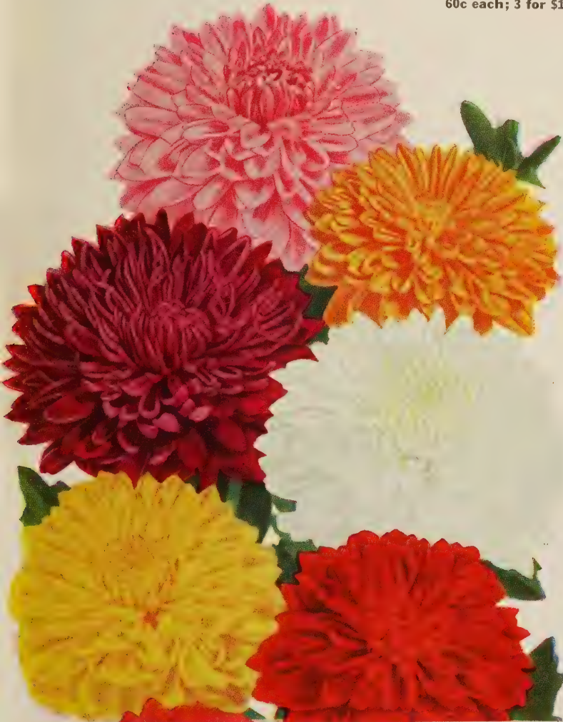
Top: CECIL BEED 60c each; 3 for $1.50